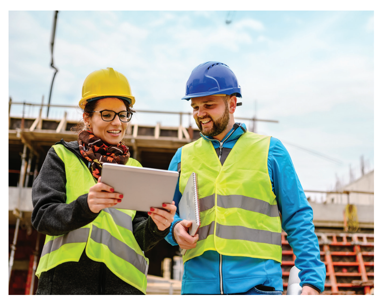
VIEW ONLINE AT: